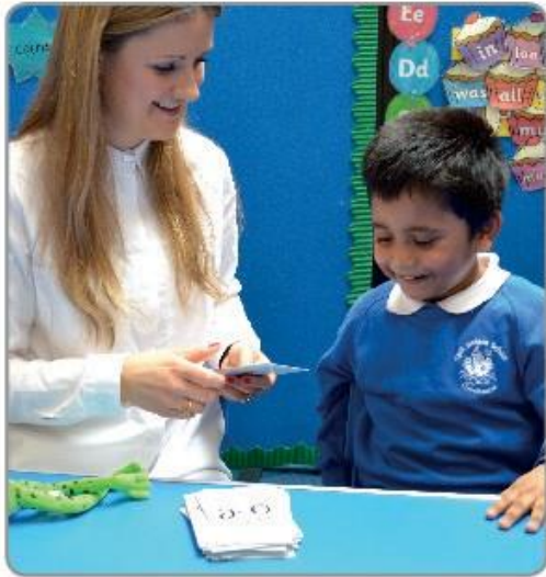
Learning the Speed Sounds in the classroom.